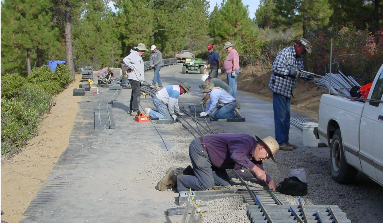
Laying Track at Panzik during the September Work Week